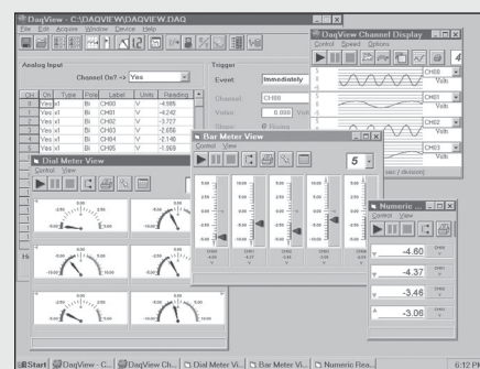
DaqView™ graphical data acquisition and display software is included with all DaqBook systems